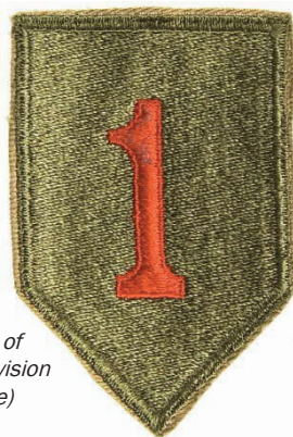
Coat of arms of the U.S. First Division (Big Red One)