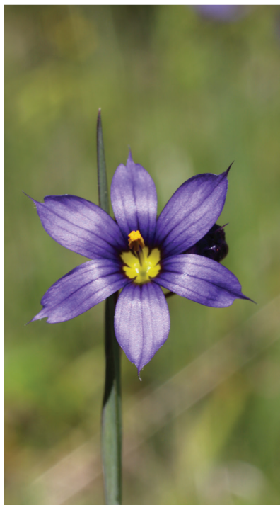
Sisyrrinchium montanum (American blue-eyed grass) An emblematic flower brought by American soldiers to the battlefields

Symbolic planting is under way to reconstitute the Big Red One's coat of arms. North American tree species have been used, such as red oak and sequoia. To delineate this symbol and create interaction with the visitors, a path will be laid around the plantation. This pathway can be made accessible to disabled visitors.